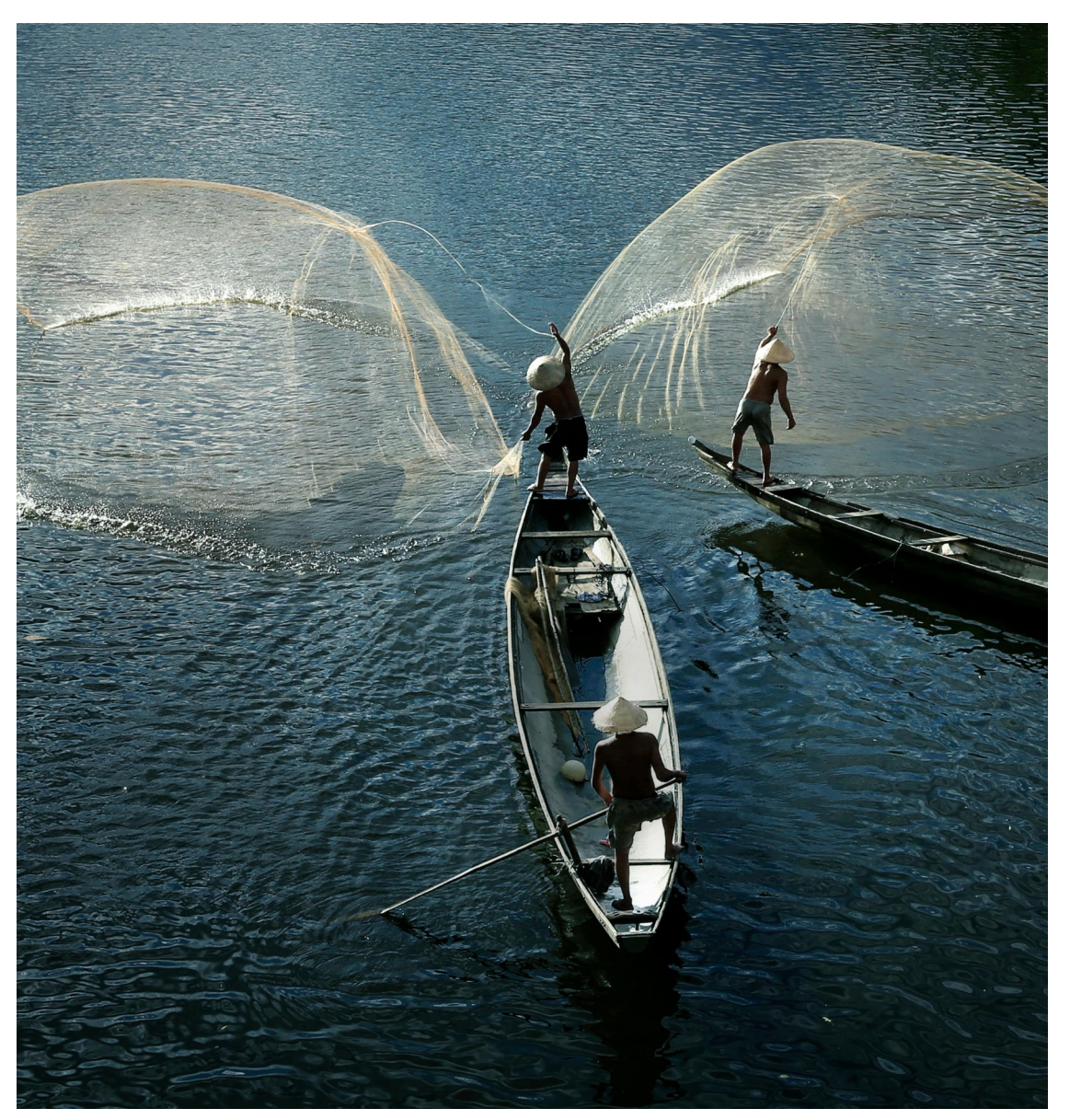
Sunday, May 11, 2025

"No matter who you are, No matter where you are on life's journey, You are welcome here."